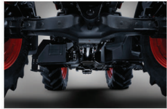
Front axle LSD