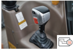
32-speed transmission (8 speeds x 2 ranges x 2 speeds)