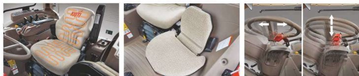
Heated premium seat