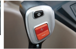
Power shift (8 speeds)