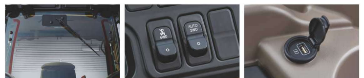
Rear wiper & Hot wire