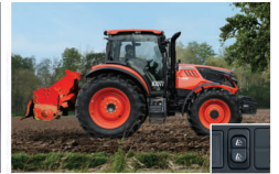
Turn-up / back-up