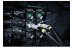
14 hydraulic ports (2 are optional)