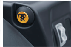
Remote rear fender PTO & 3pt switch (Left / Right)