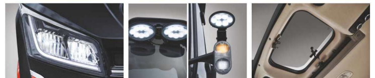
Full LED Headlight