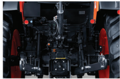
4,410 kg-f lifting force